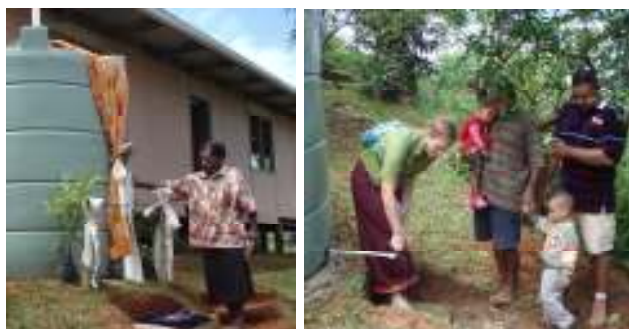
Vunisoco Tank Blessing.

roofs of two centrally located homes. Without electricity to run a well pump and with the plentiful rainfall on this side of the island, rain water collection is the best option for this community. TGNI organizes projects in underserved communities like Vunisoco around the country and FIJI Water Foundation looks forward to partnering with them on future projects.