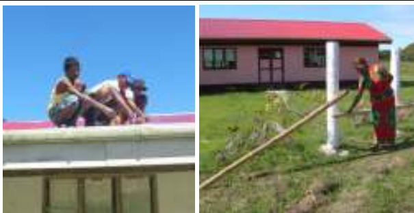
Grade 7 students paint the roof. Teacher and completed wire fence.

"Never doubt that a small group of thoughtful, committed citizens can change the world. Indeed, it is the only thing that ever has." - Margaret Mead